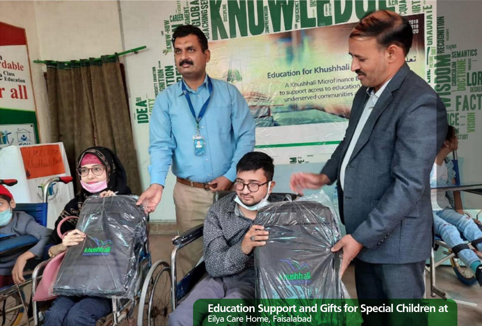
Education Support and Gifts for Special Children at Eilya Care Home, Faisalabad