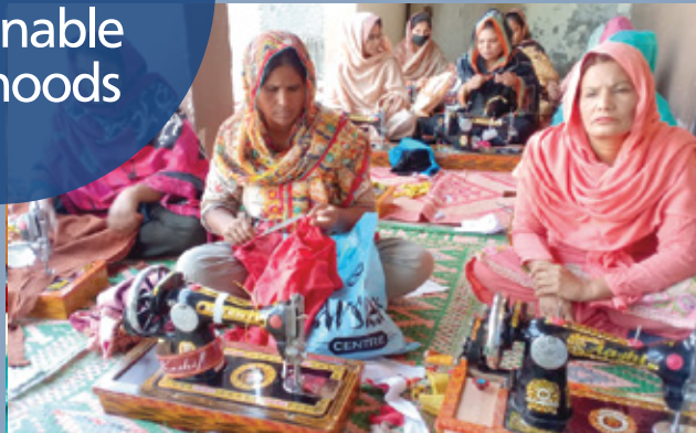
Stitching Training for women at Chak 367 Jallianwala, Gojra Faisalabad