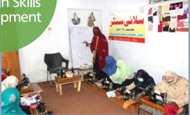
Stitching Training for Women at Chak No 1/10 L Harapa, Sahiwal