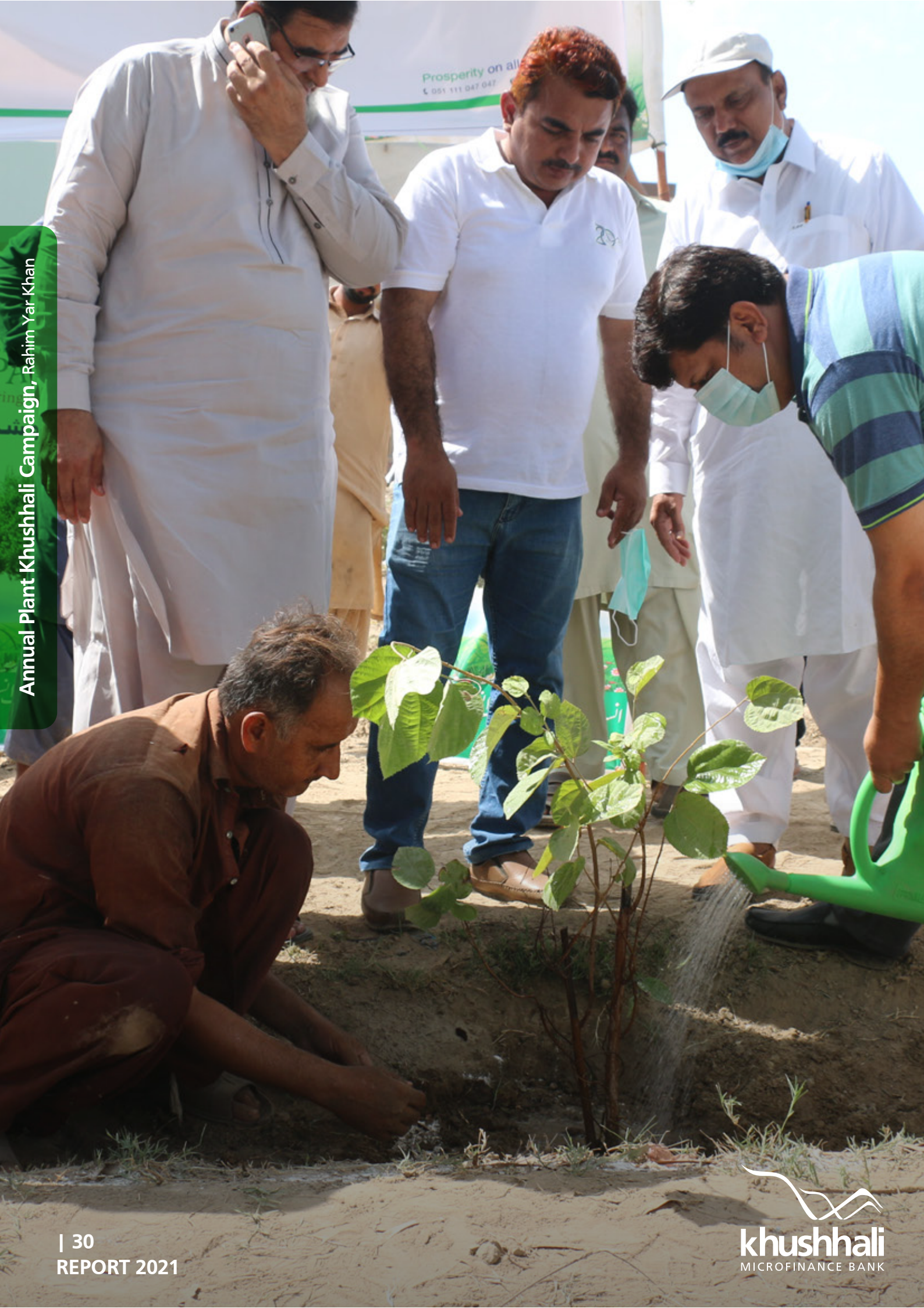
Annual Plant Khushhali Campaign, Rahim Yar Khan