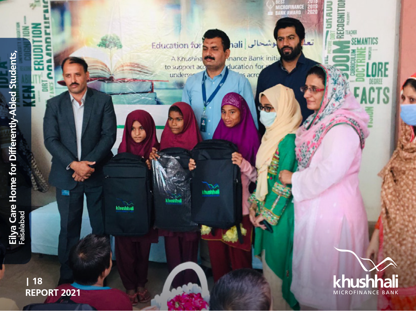
Eilya Care Home for Differently-Abled Students, Faisalabad