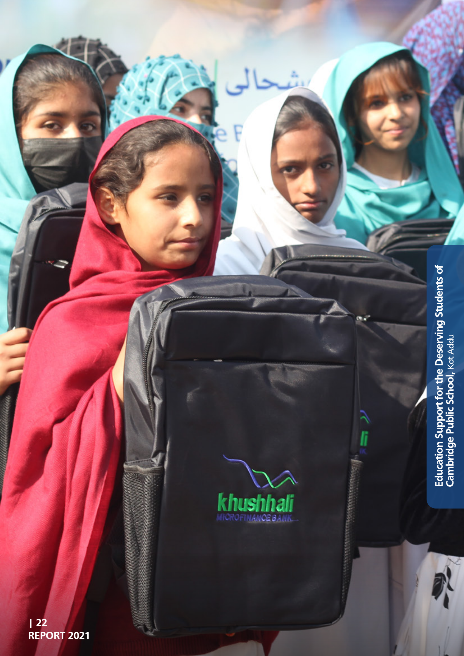
Education Support for the Deserving Students of Cambridge Public School, Kot Adlu