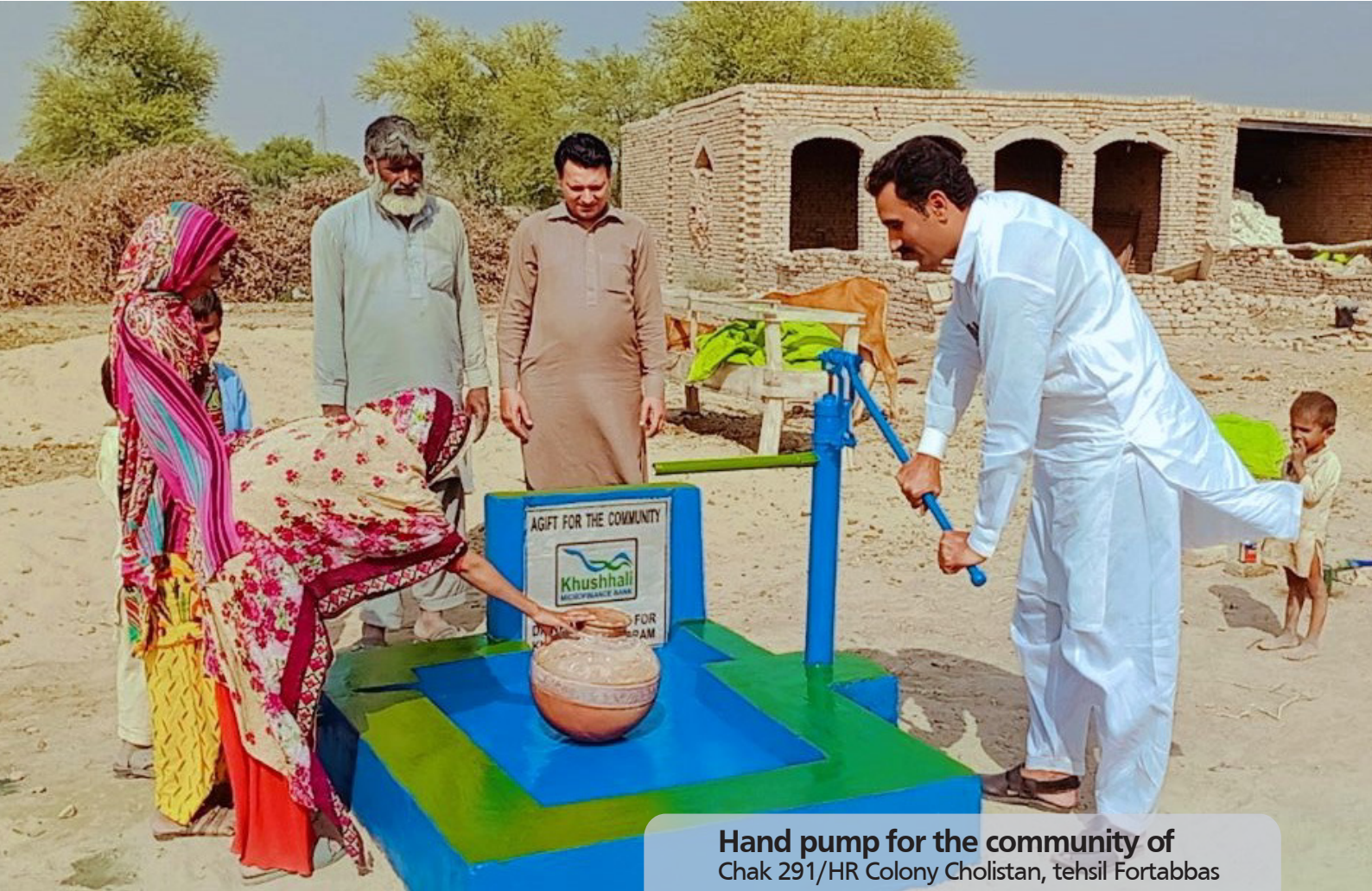
Hand pump for the community of Chak 291/HR Colony Cholistan, tehsil Fortabbas