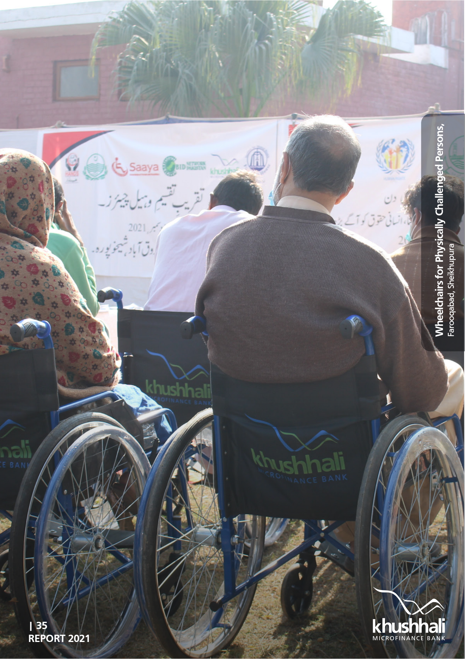
Wheelchairs for Physically Challenged Persons, Farooqabad, Sheikhupura