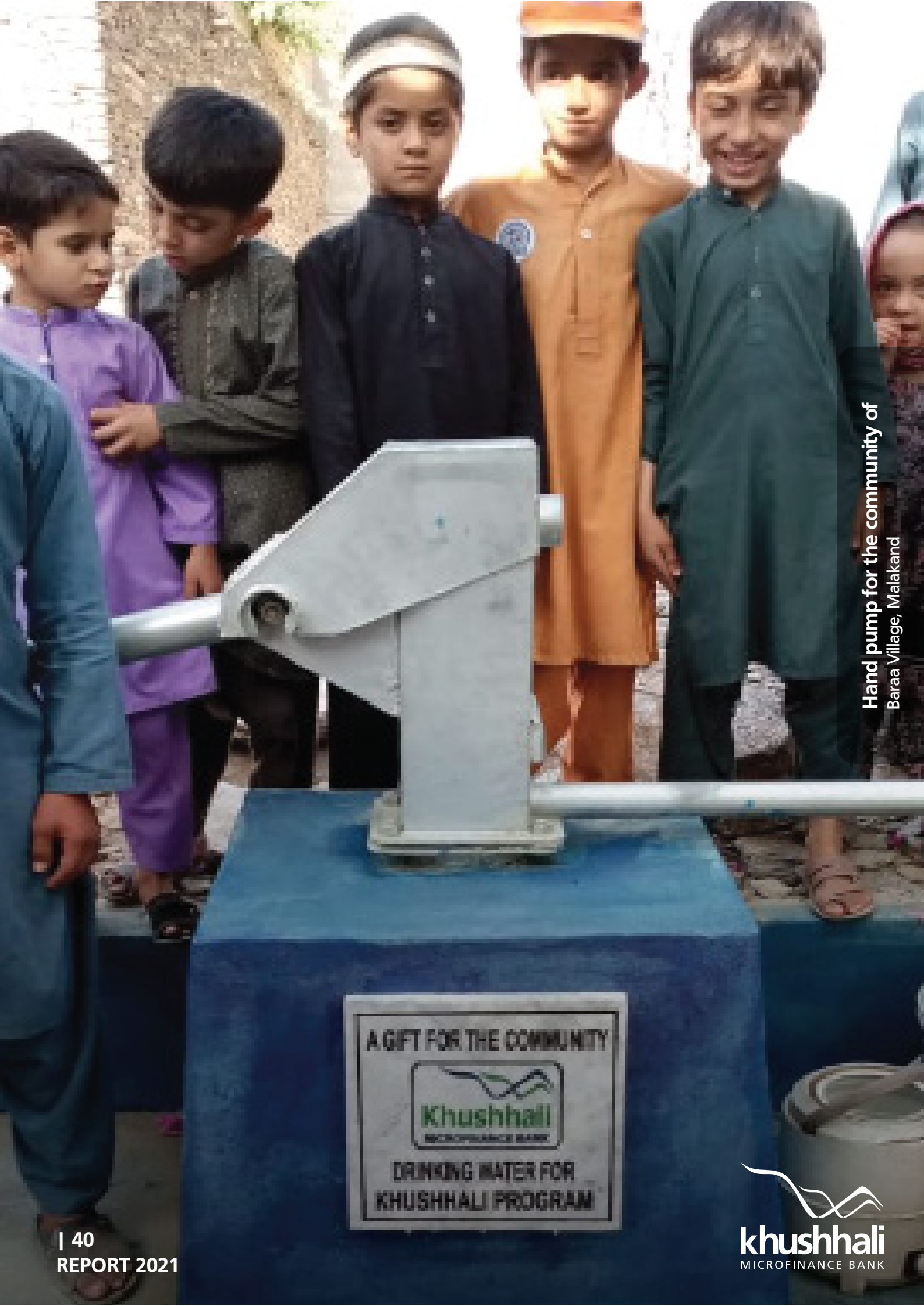
Hand pump for the community of Baraa Village, Malakand