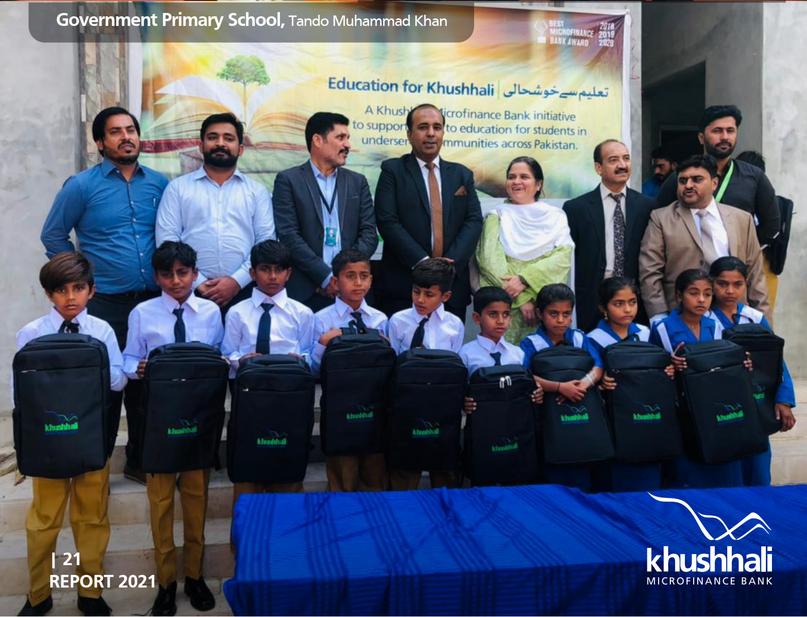
Government Primary School, Tando Muhammad Khan