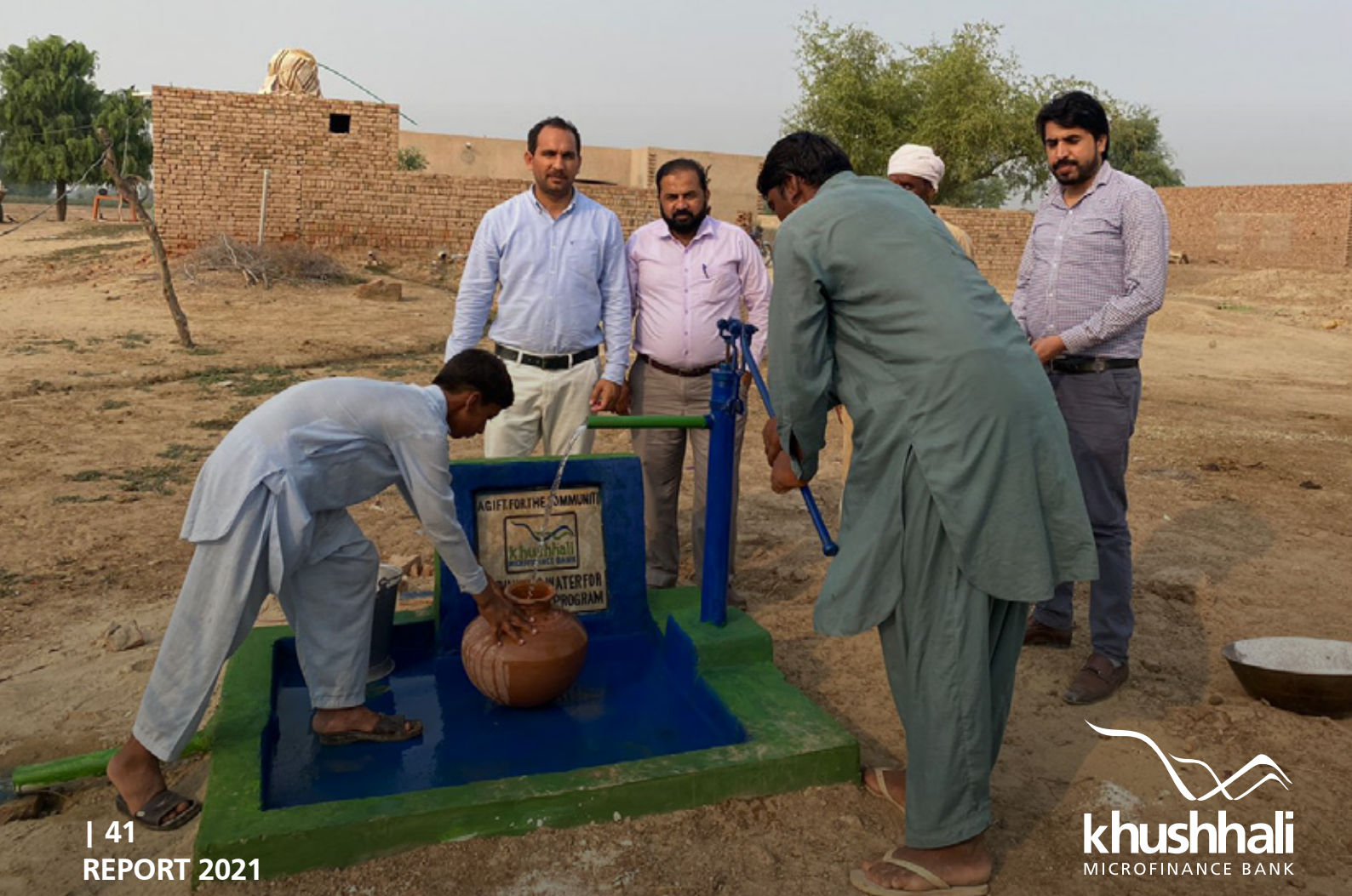
Hand pump for the community of Azafi Basti Mustafabad Chak No. 340/H.R, Marot