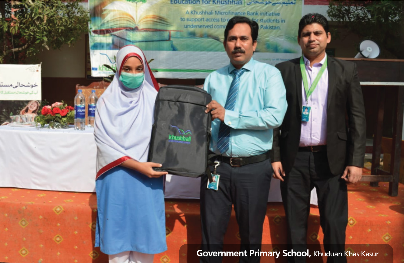
Government Primary School, Khuduan Khas Kasur