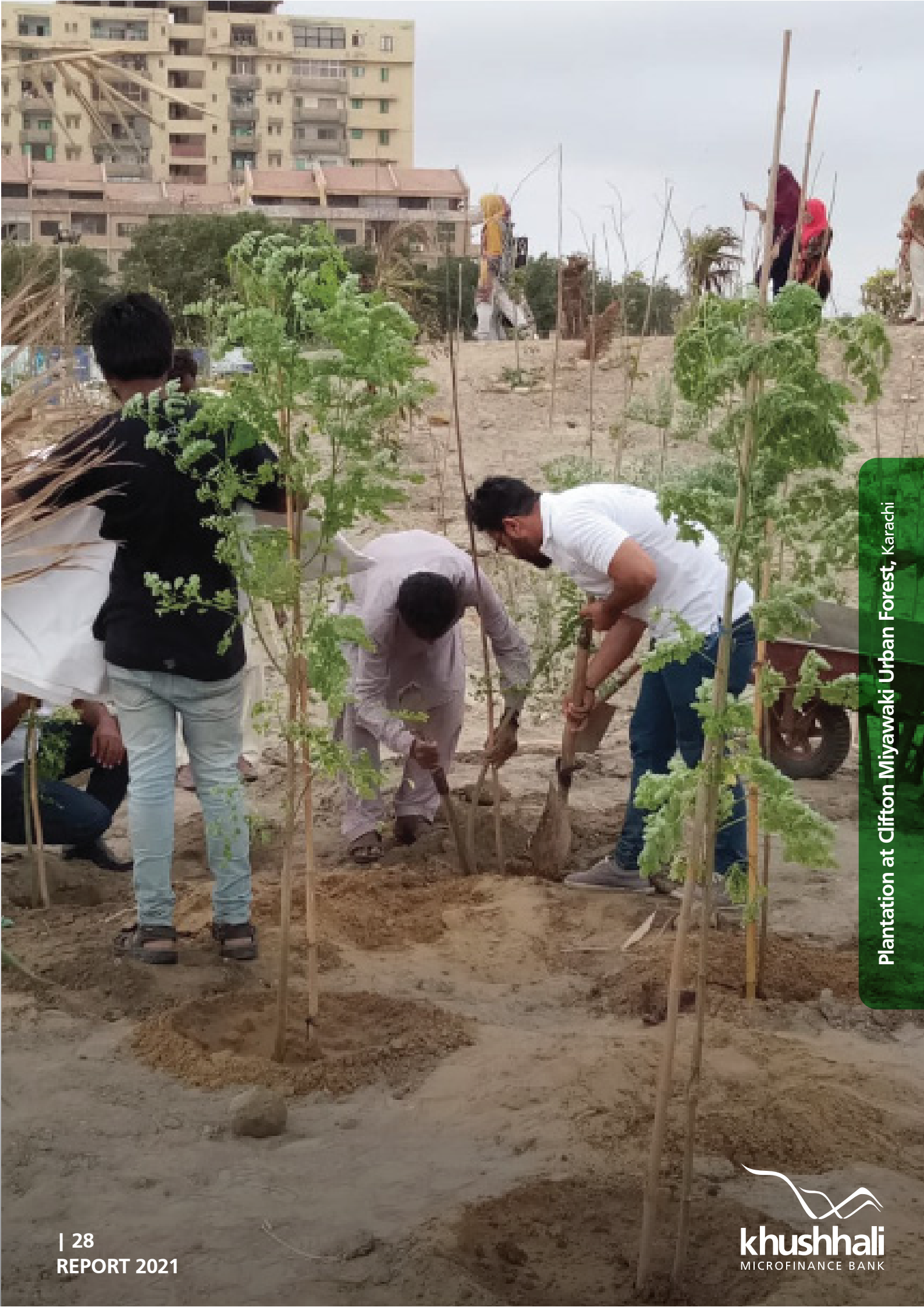
Plantation at Clifton Miyawaki Urban Forest, Karachi