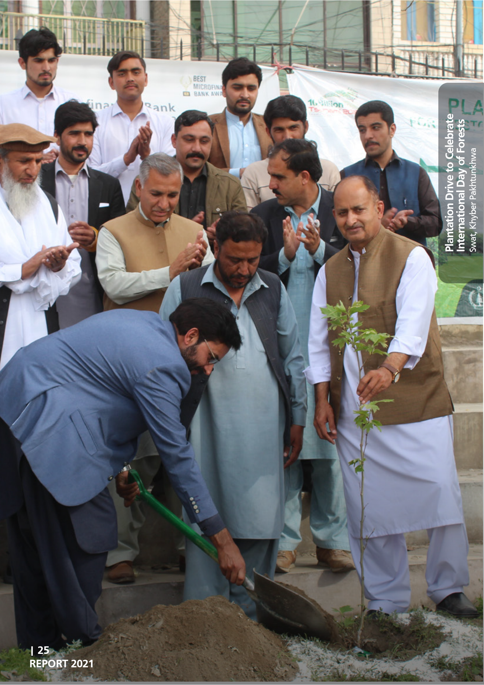
Plantation Drive to Celebrate International Day of Forests Swat, Khyber Pakhtunkhwa