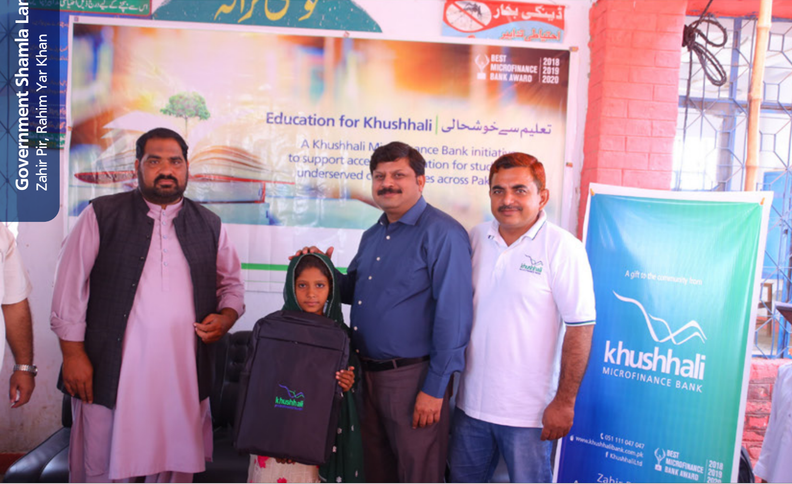
Government Shamla Langh School, Zahir Pir, Rahim Yar Khan