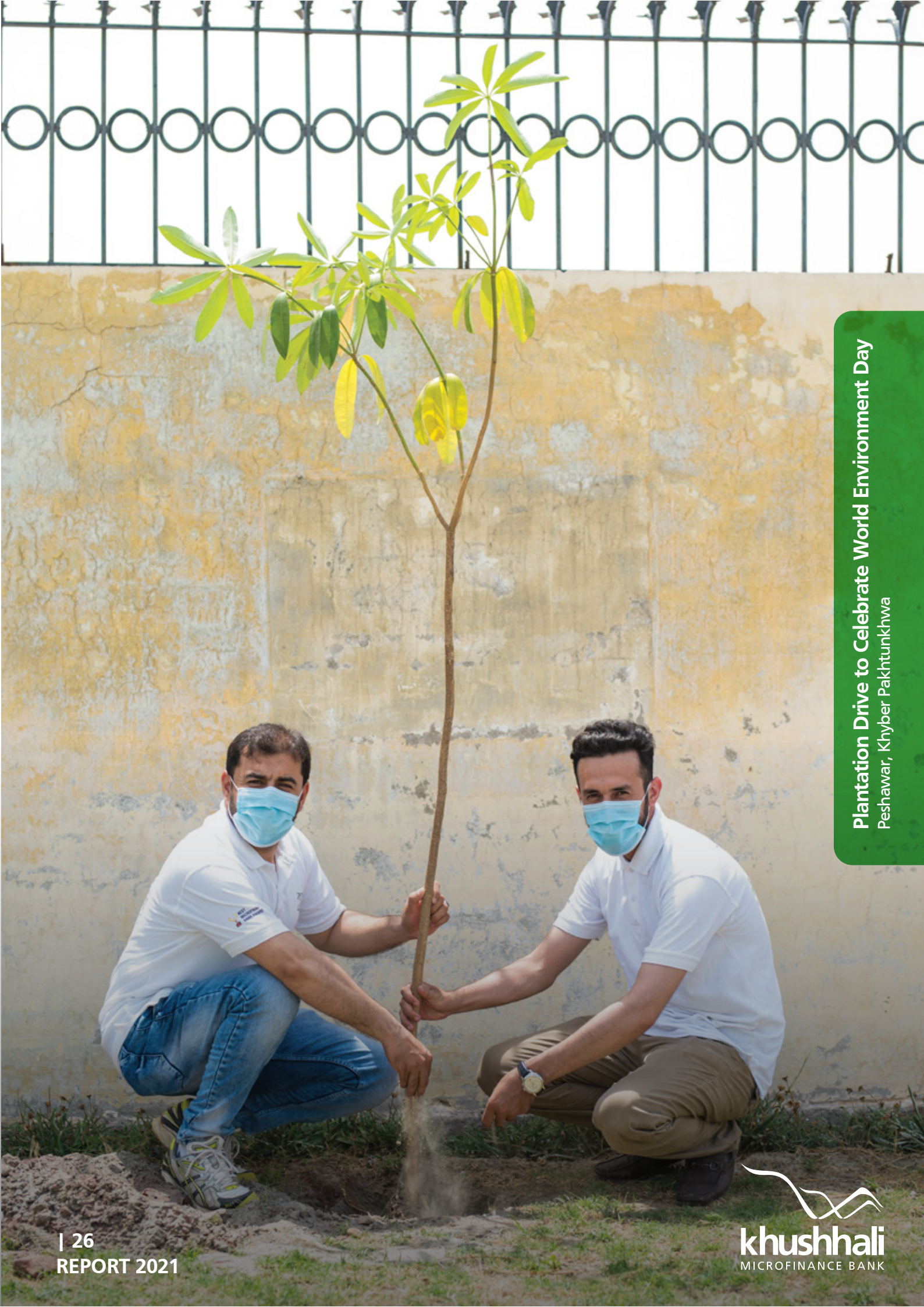
Plantation Drive to Celebrate World Environment Day Peshawar, Khyber Pakhtunkhwa