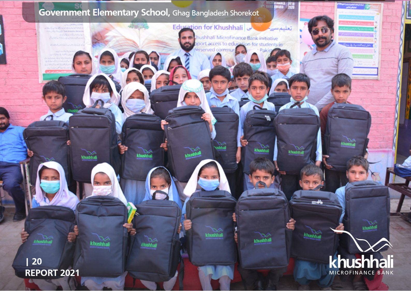
Government Elementary School, Ghag Bangladesh Shorekot