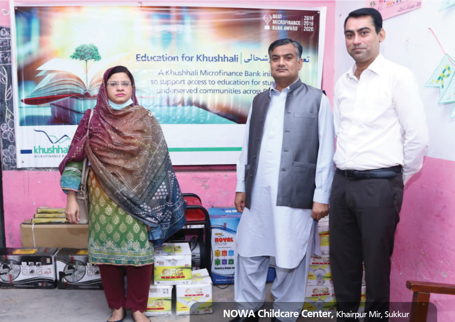
NOWA Childcare Center, Khairpur Mir, Sukkur