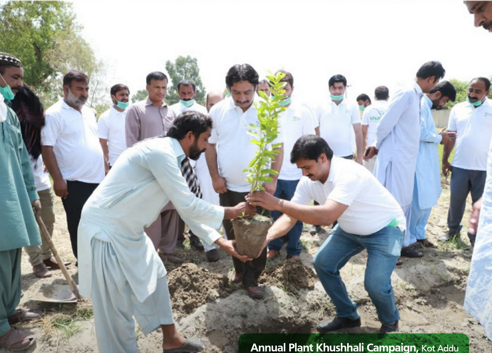
Annual Plant Khushhali Campaign, Kot Addu